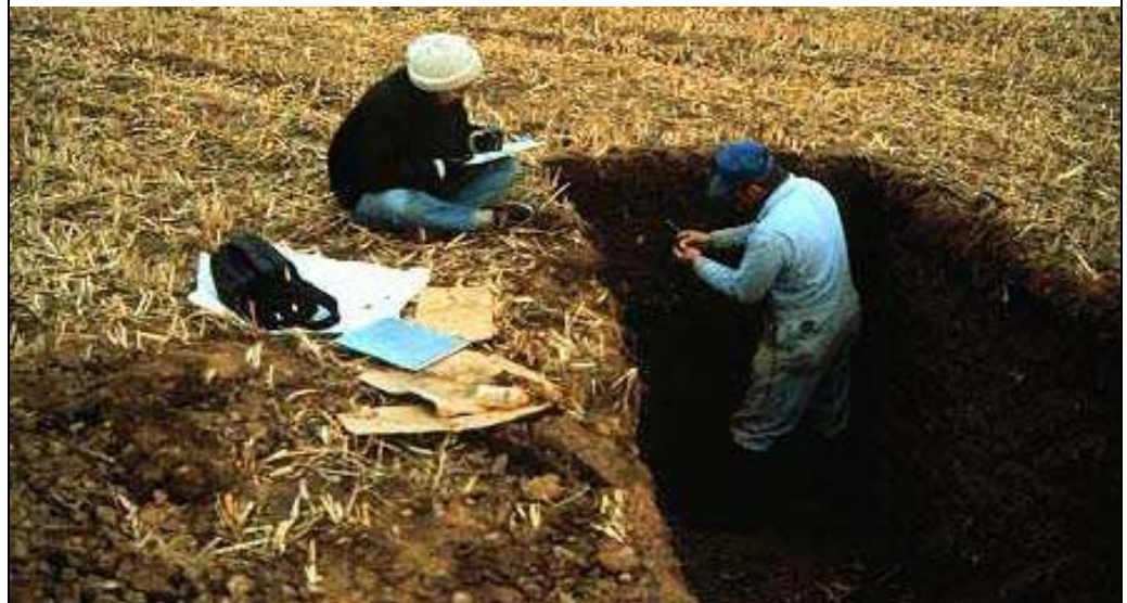
Example Profile Pit